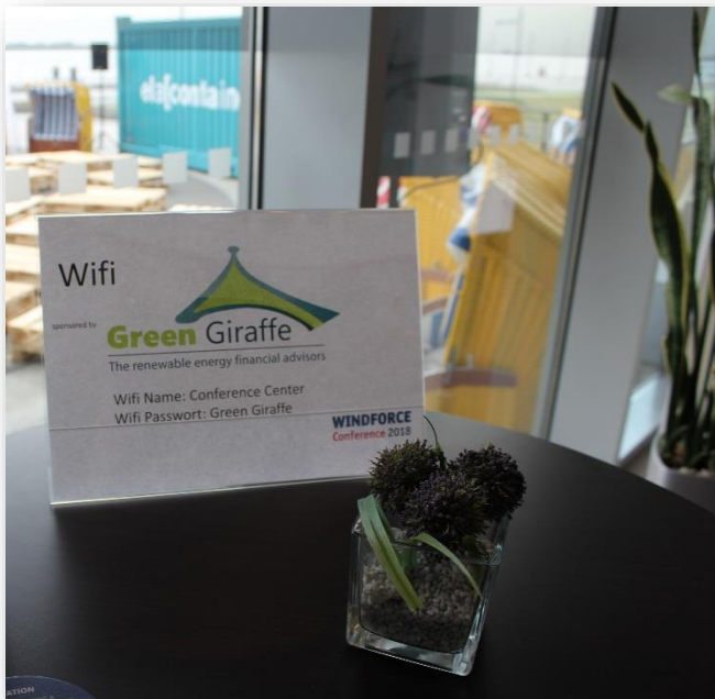
Caption: WiFi Code Green Giraffe