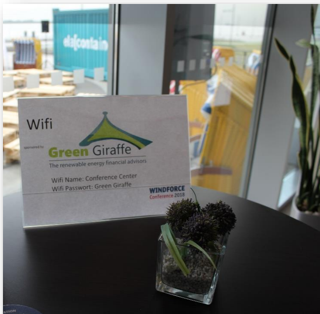
Caption: WiFi Code Green Giraffe